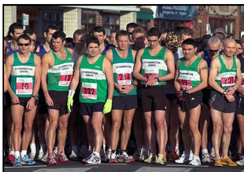
Line up: Stubbies await the gun at the 2007 Stubb 10k

However, we need to continue to uphold and build on this reputation which is only possible with your involvement and support on the day. Without your co-operation, we won't be able to continue to be as successful as we've been over the past quarter of a century - so be proud to be a part of it! See page 2 for more details about volunteering to help out.